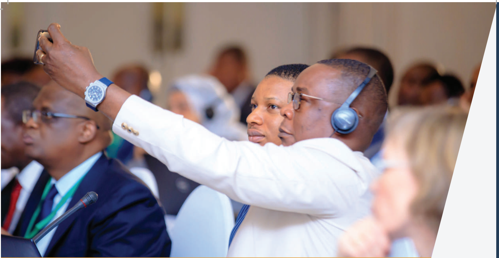
Policy makers following presentations during our 21st Senior Policy Seminar. The Seminar was jointly organized with the Reserve Bank of Zimbabwe, and the Macroeconomic and Financial Management Institute of Eastern and Southern Africa (MEFMI).