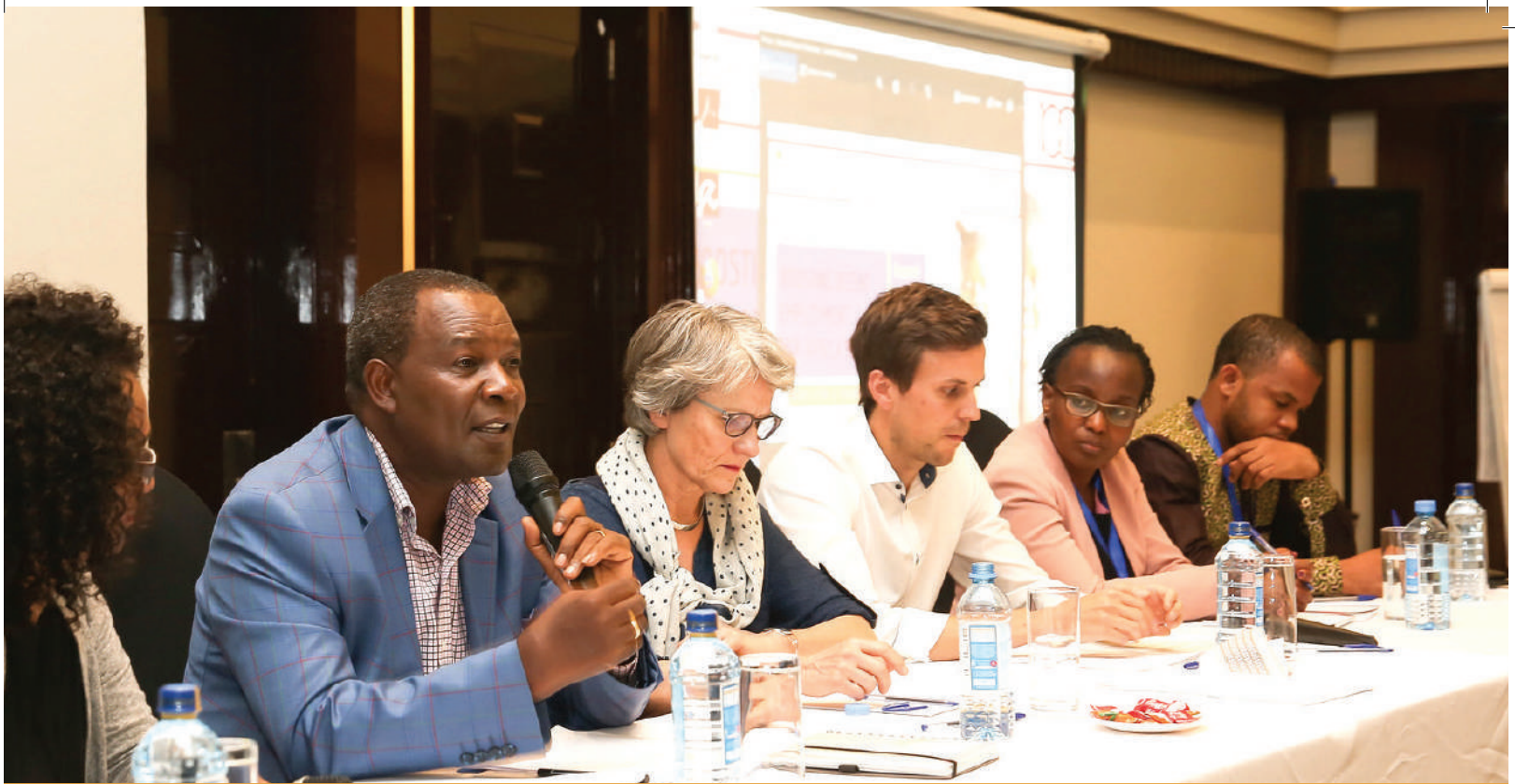
AERC's Executive Director welcoming participants to the 'Boosting Decent Employment for Africa's Youth' workshop convened in collaboration with IDRC, Include Platform and the ILO in January 2019.