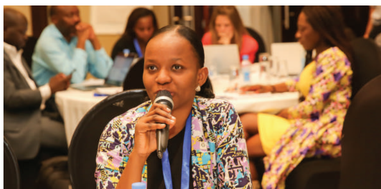
Participant engages in discussion at the ‘Boosting Decent Employment for Africa’s Youth’ workshop in January 2019.