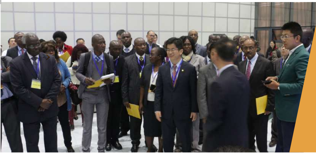
Nearly 100 policy makers, senior government officials and ambassadors from African countries based in Nairobi, Kenya attended the China-Africa Infrastructure Cooperation in Africa: The Mombasa-Nairobi Standard Gauge Railway (SGR) seminar. Pictured at SGR in June 2018.