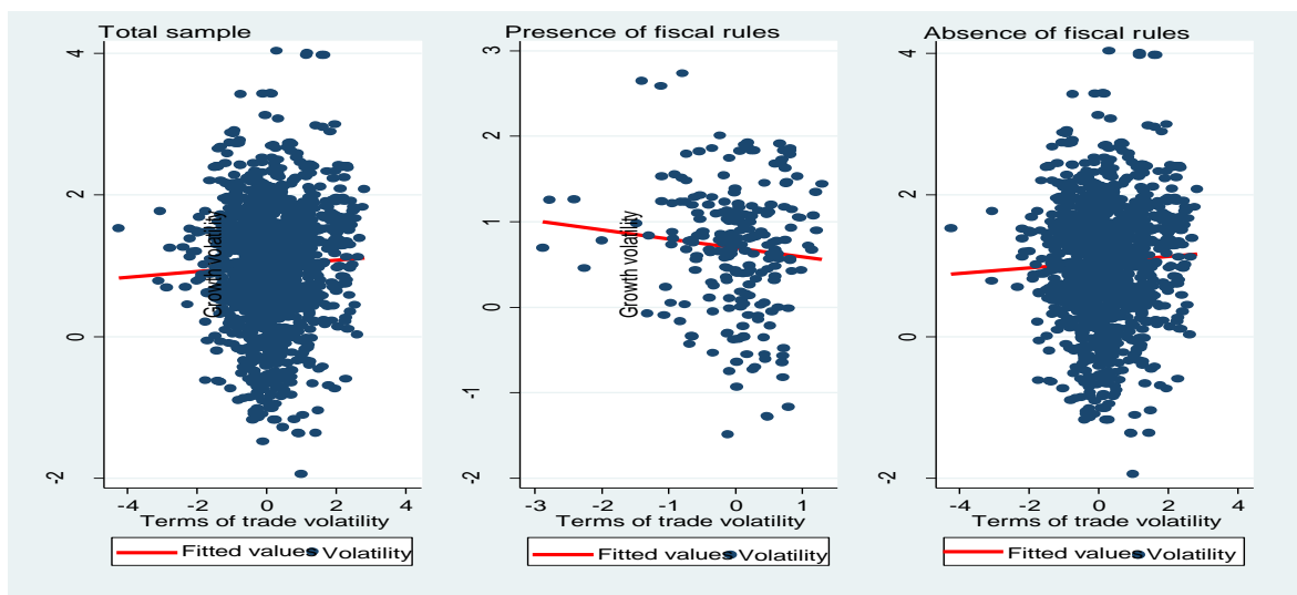
Figure 3: Relationship between terms of trade volatility and growth volatility according to budgetary rules

The same analysis conducted with budgetary rules gives similar results. Figure 3 suggests that fiscal rules appear to play a mitigating role in the transmission of terms of trade shocks to the economy, because the correlation between terms of trade volatility and volatility growth is low during episodes of fiscal rules (Figure 3, middle panel). Conversely, for episodes with an absence of fiscal rules, terms of trade shocks are strongly and positively correlated with growth volatility (right-hand panel). These results could suggest that countries that have adopted fiscal rules have greater opportunities to pursue countercyclical fiscal policies and mitigate the impact of shocks. Given these preliminary results, an econometric analysis is necessary to confirm these results. The following subsection presents the results of the econometric estimations.