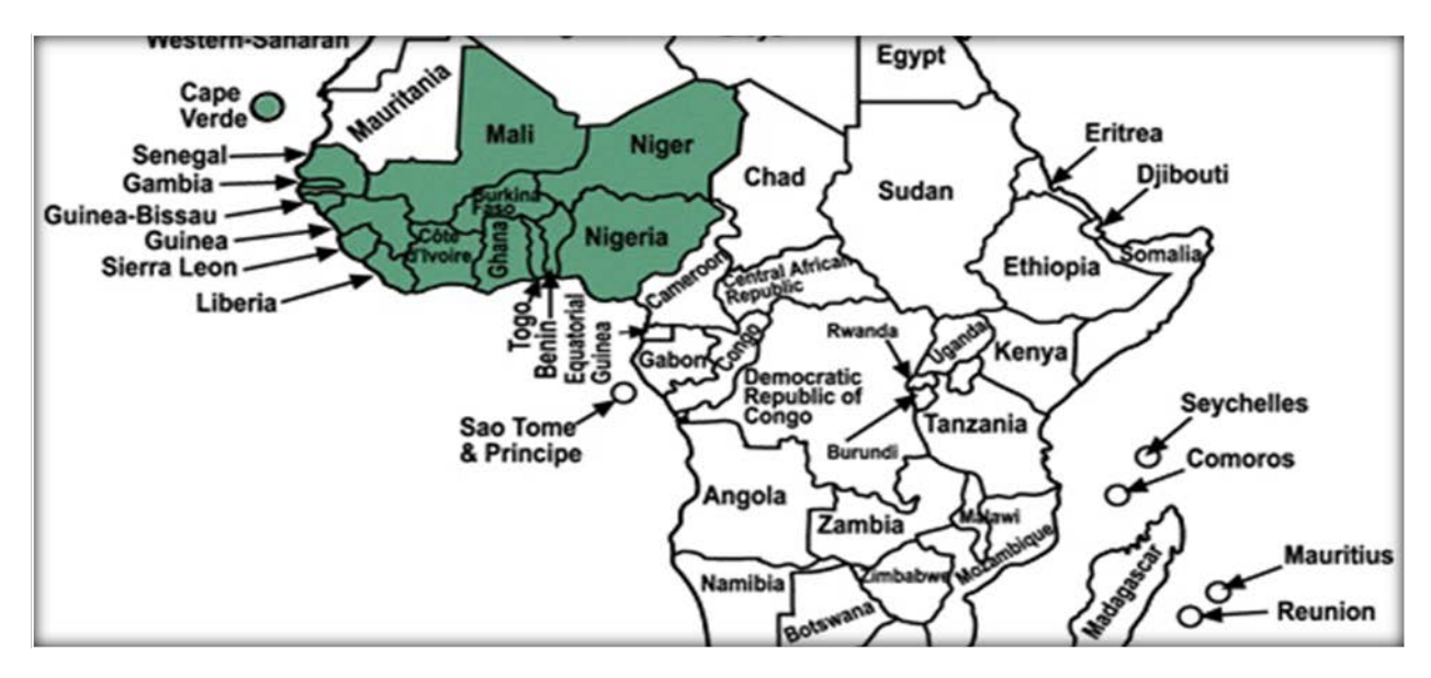
Map of Africa Showing ECOWAS countries

The estimation began by determining the descriptive statistics of the variables. This required estimating the mean, median, maximum and minimum values; skewness, kurtosis, and standard deviation of the series. Most of the series had values greater than 0.05, indicating that the series are normally distributed. The value of skewness for each of the series is close to zero, while the kurtosis ranges between 2.7 and 3.1. Largely, the series can thus be adjudged to be normally distributed.